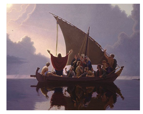
The LORD gives strength to his people; the LORD blesses his people with peace. Psalm 29:11

Q: Are you experiencing a true sense of peace because you know and follow Jesus, even when our world is possibly more of an anxious place than ever before?